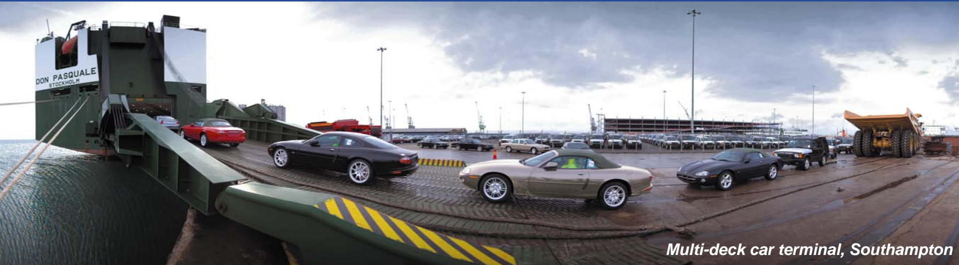
Multi-deck car terminal, Southampton