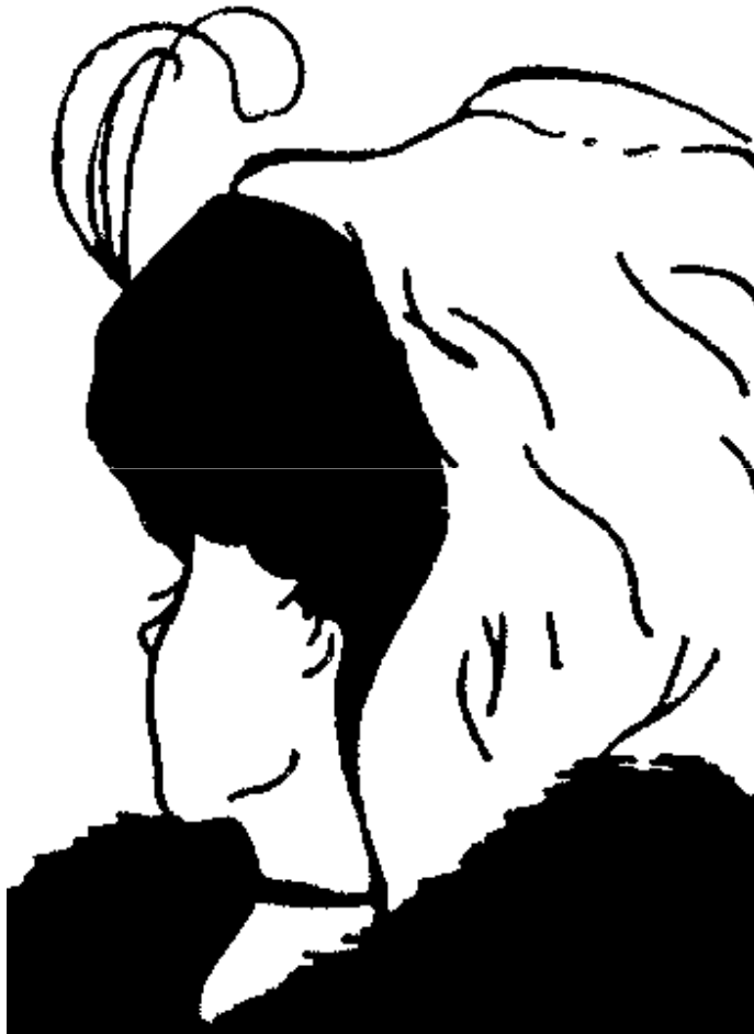
My wife and mother-in-law W.E. Hill (1915)

Last night I shot a bear in my pyjamas. What he was doing in my pyjamas I'll never know... (Groucho Marx)