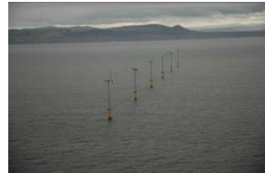
Partnership Involving Stakeholders in the Celtic Sea EcoSystem